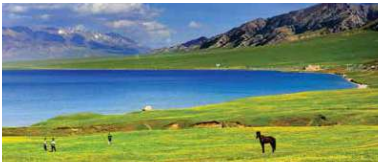
赛里木湖景区 Sayram Lake