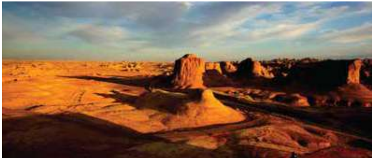
魔鬼城 Ghost Town