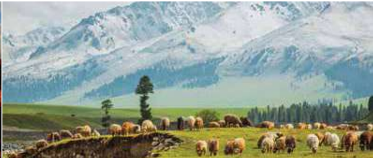
那拉提草原 Nalati Grassland

Assemble at international airport, departure flight to North Xinjiang - Urumuqi via transit city.