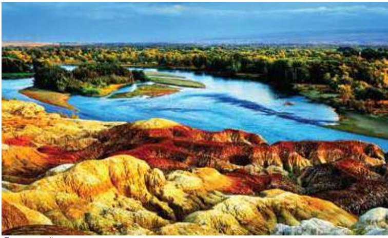
五彩滩 Colorful Beach