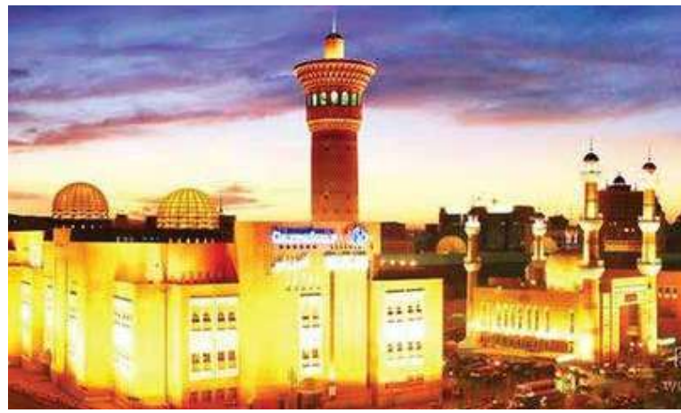
国际大巴扎 Grand Bazaar