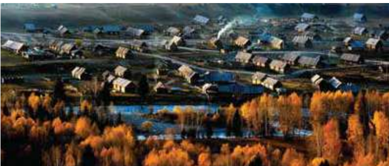
禾木村 Hemu Village