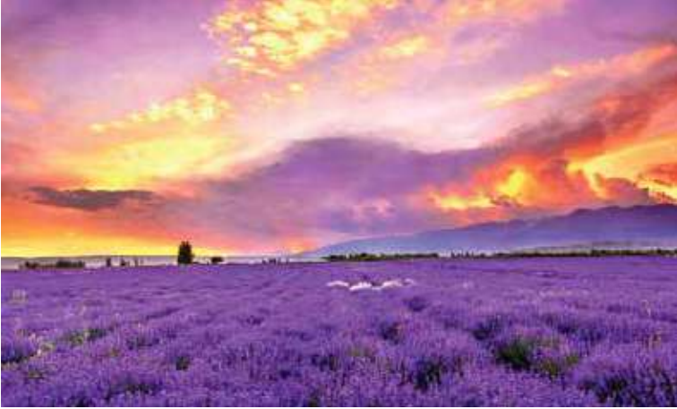
薰衣草花田 Lavender Field