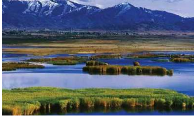
可可托海风景区 Koketohai National Geological Park