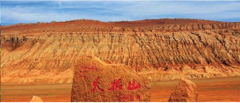
火焰山 Flaming Mountains