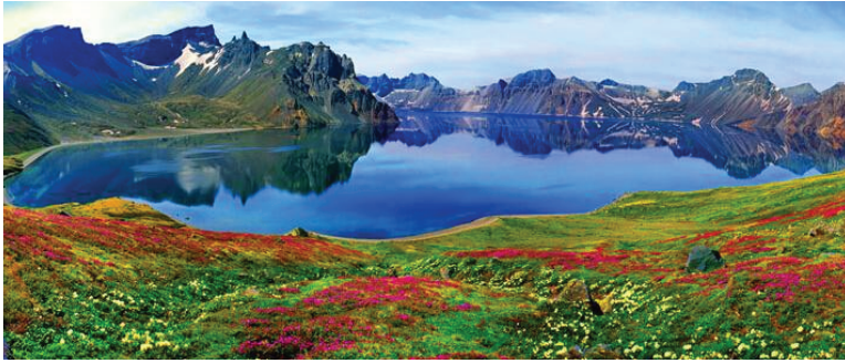
天山天池 Tianshan Tianchi