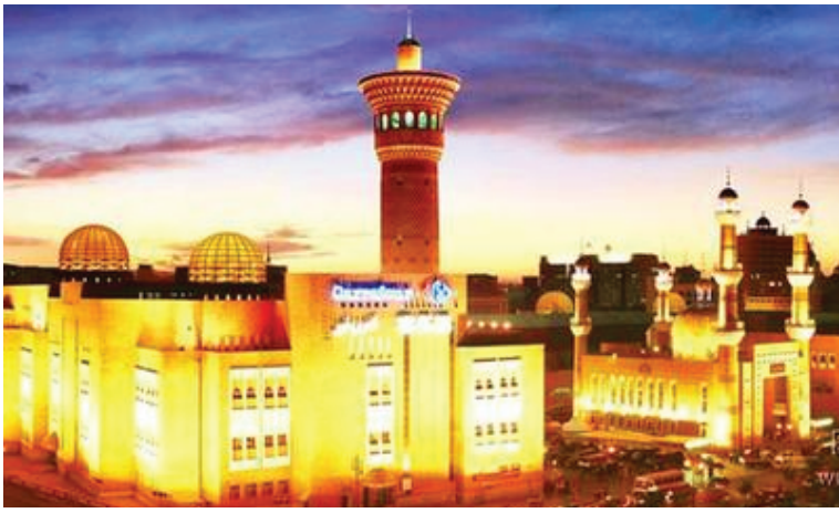
国际大巴扎 Grand Bazaar