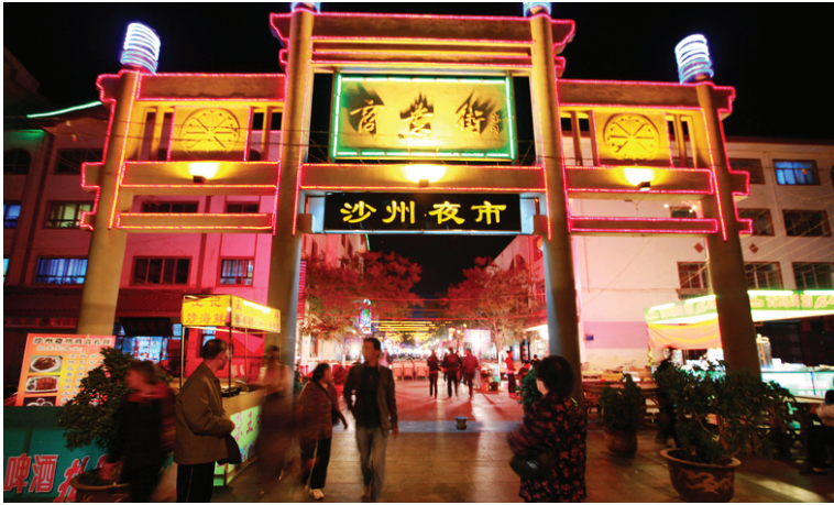
沙洲夜市 Shazhou Night Market