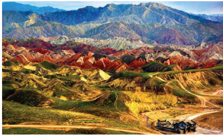
丹霞地质公园 Danxia National Geopark