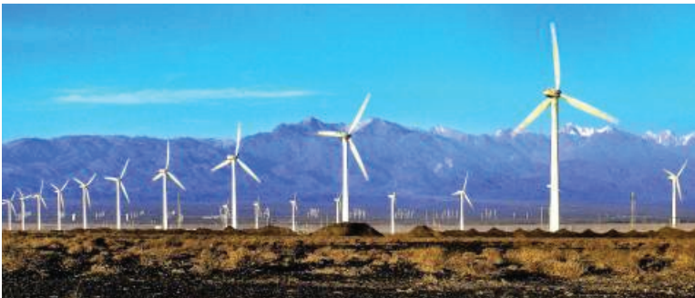
风力发电站 Wind Power Station