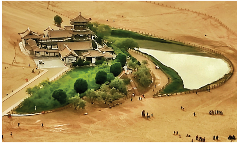
月牙泉 Crescent Lake