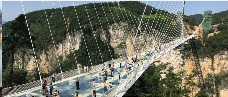
张家界大峡谷 Zhangjiajie Grand Canyon