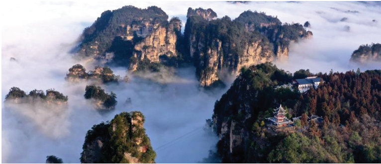
黄石寨风景区 Huangshizhai Scenic Area