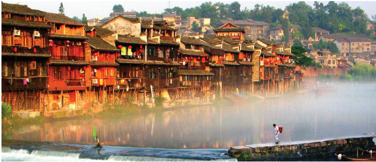
凤凰古城 Fenghuang Ancient Town