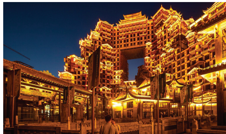
七十二奇楼 72 Tujia Stilted Buildings