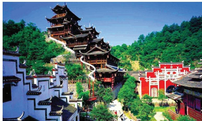
土家风情园 Zhangjiajie Tujia Folk Garden