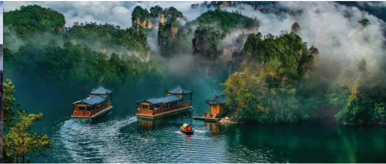
宝峰湖 Baofeng Lake

Assemble at international airport, departure international flight to Zhangjiajie.