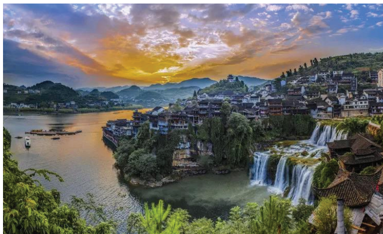
芙蓉镇 Furong Town