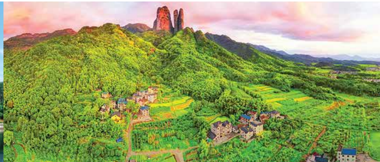
江郎山风景区 Jianglang Mountain Scenic Area