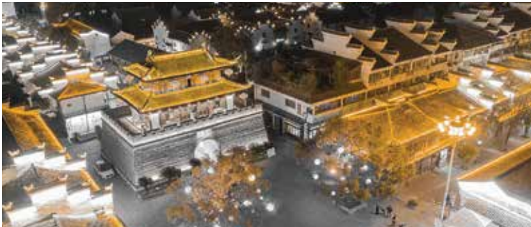
婺州古城 Wuzhou Ancient City