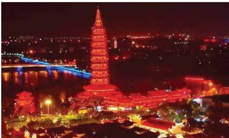
万佛塔 Wanfo Pagoda