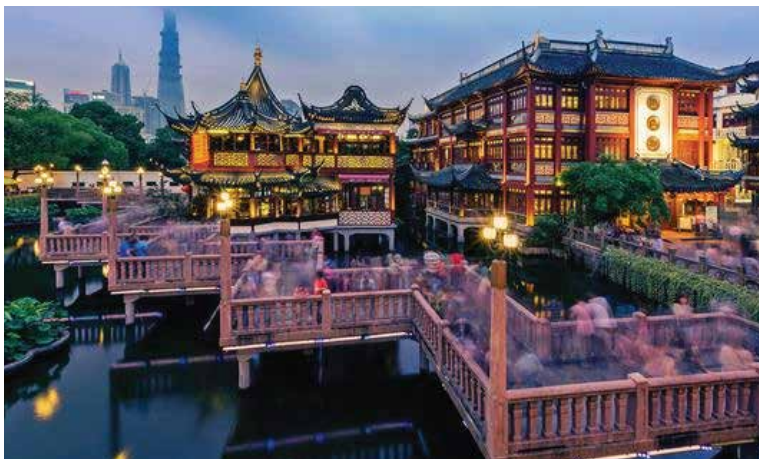
豫园城隍庙商圈 Yuyuan Cheng Huang Temple Shopping District