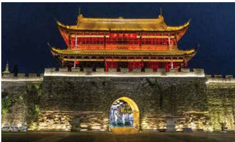
水亭门 Shuiting Gate