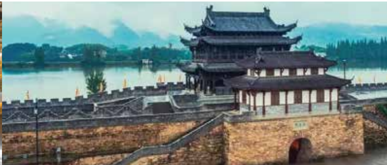
梅城古镇 Meicheng Ancient Town