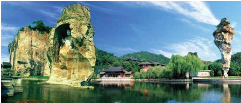
柯岩风景区 Keyan Scenic Area