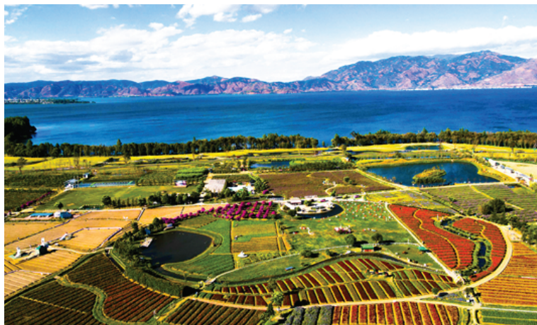
洱海生态廊道 Erhai Ecological Corridor