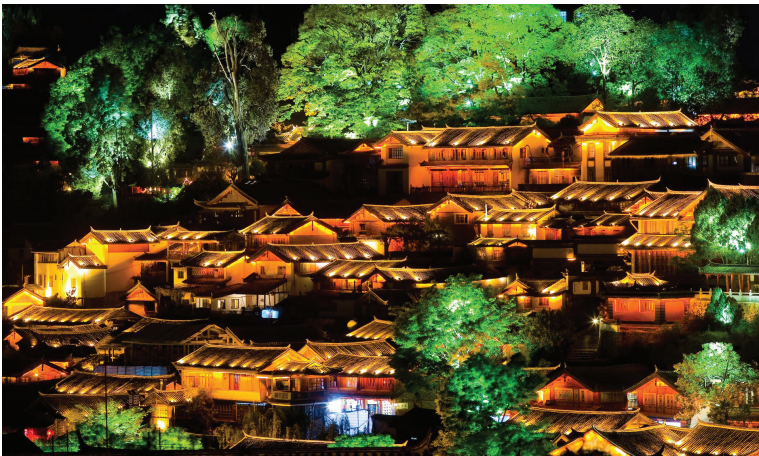
丽江古城 Lijiang Ancient Town