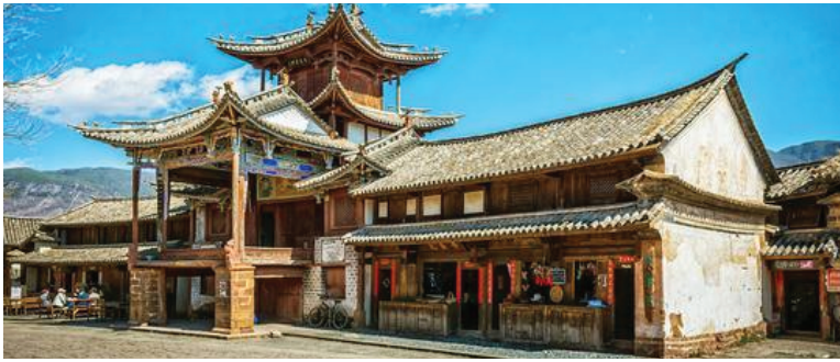
沙溪古镇 Shaxi Ancient Town