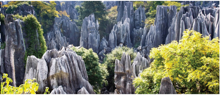
石林风景区 Shilin National Scenic Area