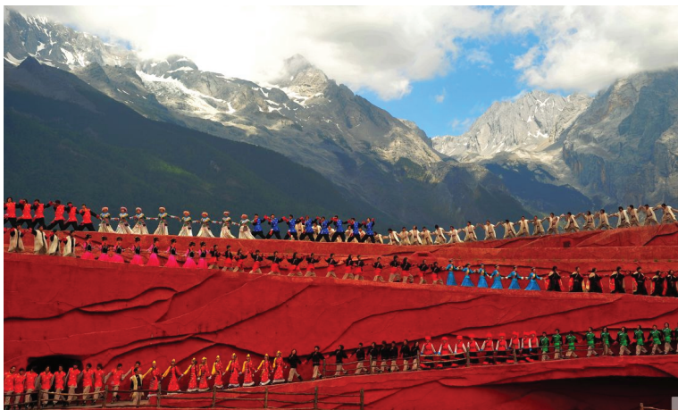
印象丽江 Impression Lijiang Show