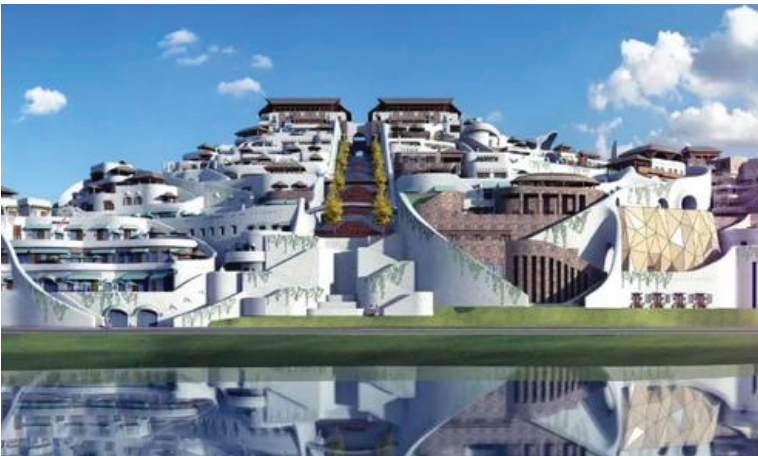
理想邦 Ideal City