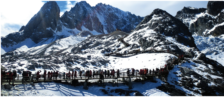
玉龙雪山 Yulong Snow Mountain