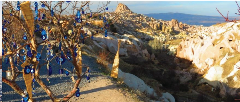
鸽子山谷 Pigeon Valley

Assemble at international airport, departure flight to Turkey - Istanbul.