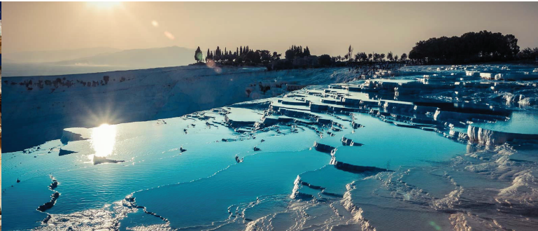
棉花堡 Cotton Castle