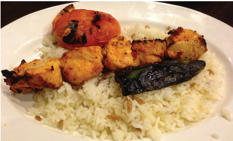
土耳其“鸡肉串” Turkish “Kebab”