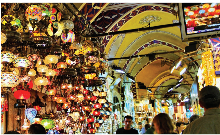
大巴扎 Grand Bazaar