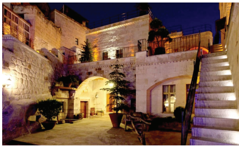
洞穴酒店 Cave Hotel