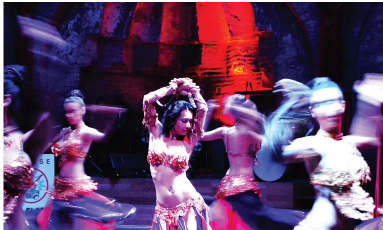
肚皮舞秀 Belly Dance Show