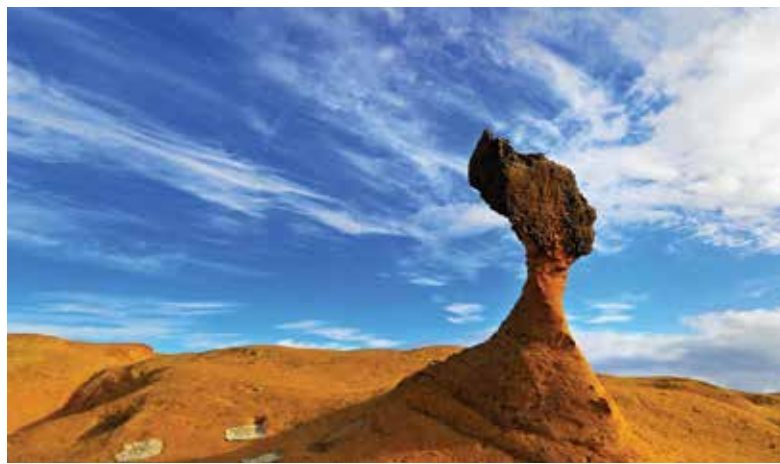
野柳地质公园 Yehliu Geopark