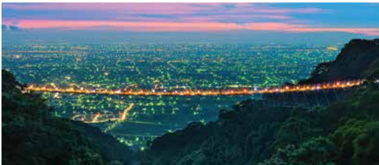
猴探井天空之桥 Houtanjin Sky Bridge