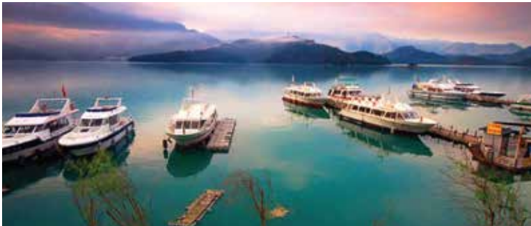
日月潭国家风景区 Sun Moon Lake