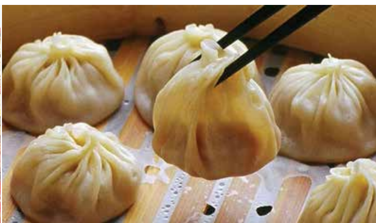
金品小笼包 King Ping Xiaolongbao