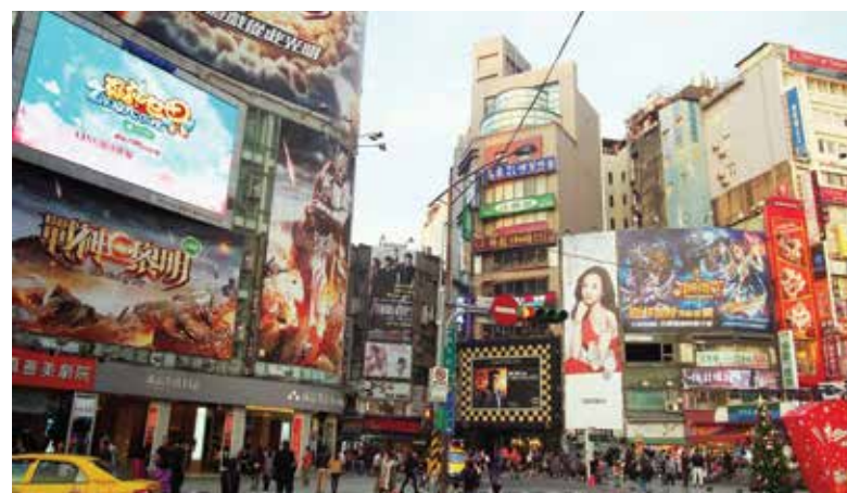
西门町 Ximending Shopping District