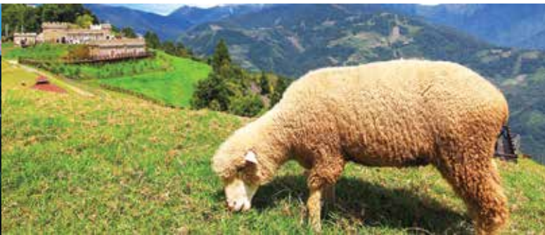
清境农场 Qingjing Farm