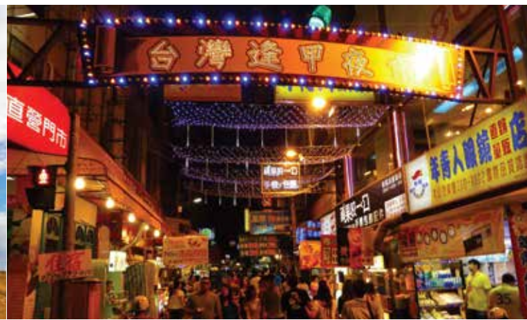
逢甲夜市 Fengjia Night Market