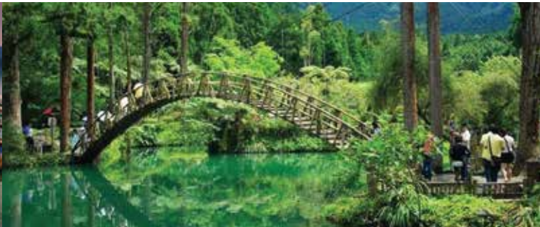
溪头森林游乐区 Xitou Forest Recreation Area

Assemble at international airport, departure flight to Taiwan.