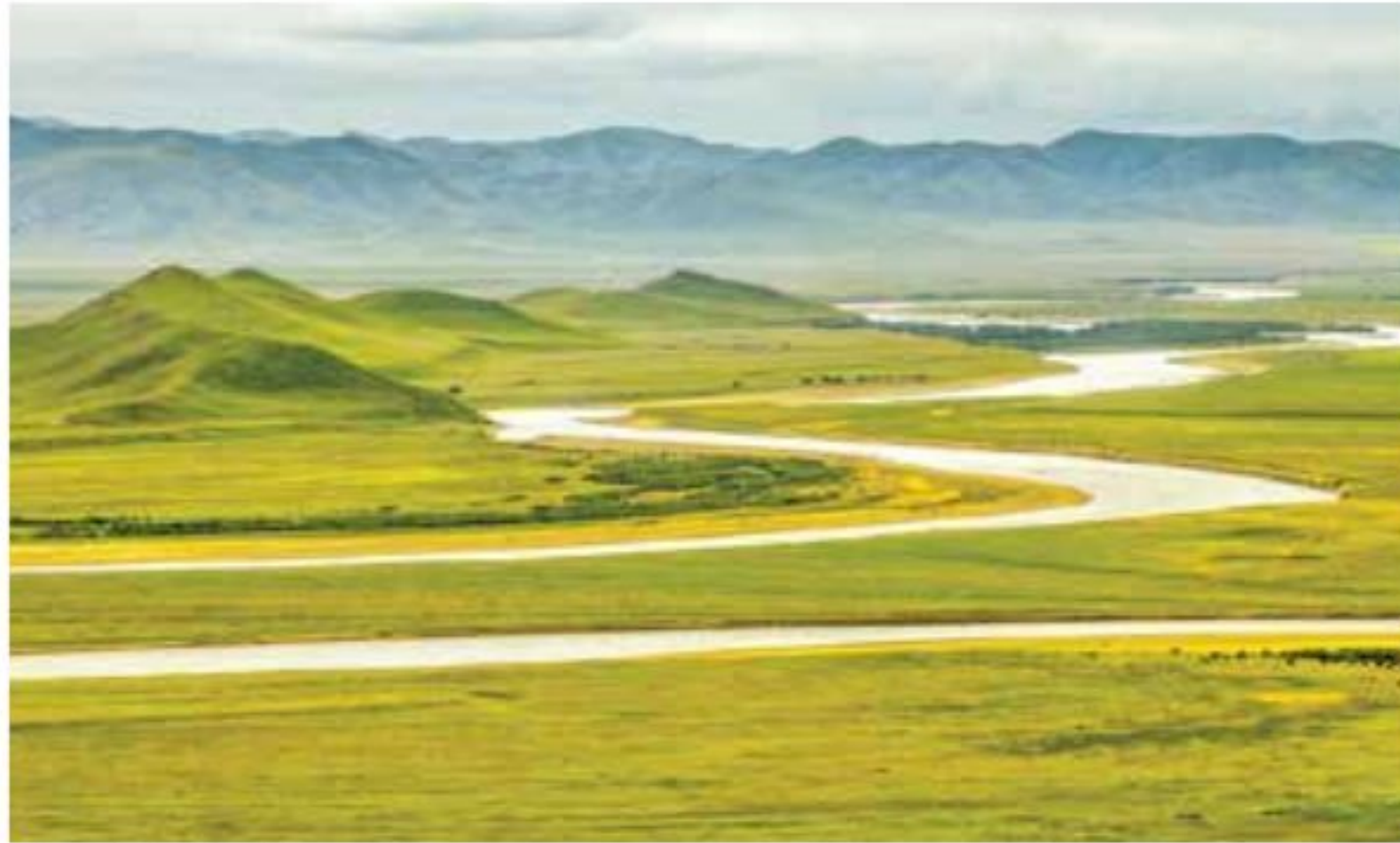
九曲黄河第一湾 The First Bend of The Yellow River