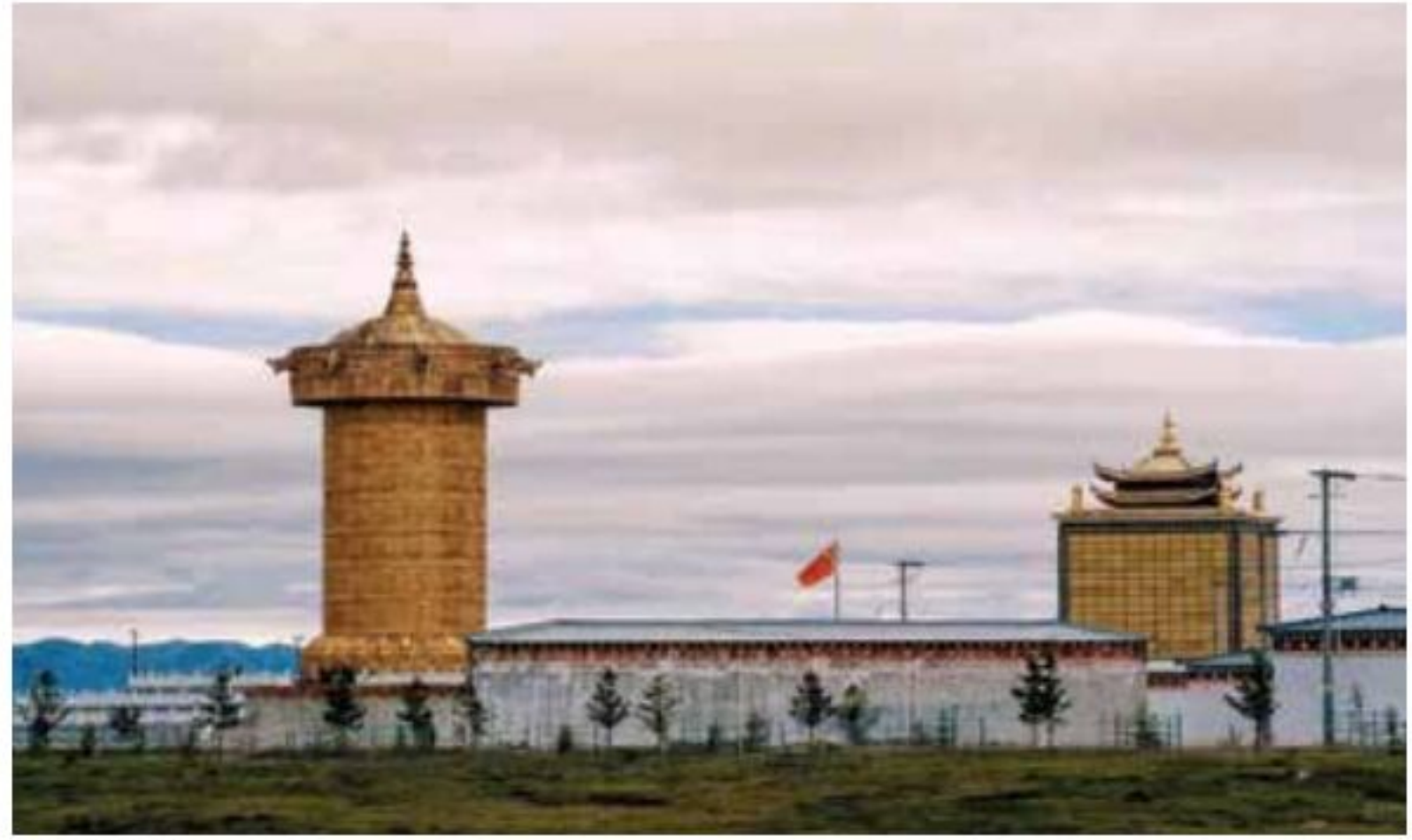
娘玛寺 Niangma Monastery