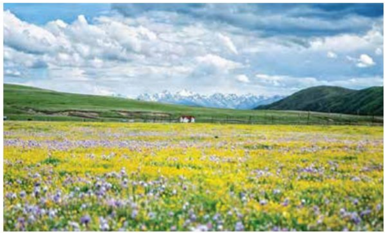
俄么塘花海景区 Emotang Flower Sea Scenic Area