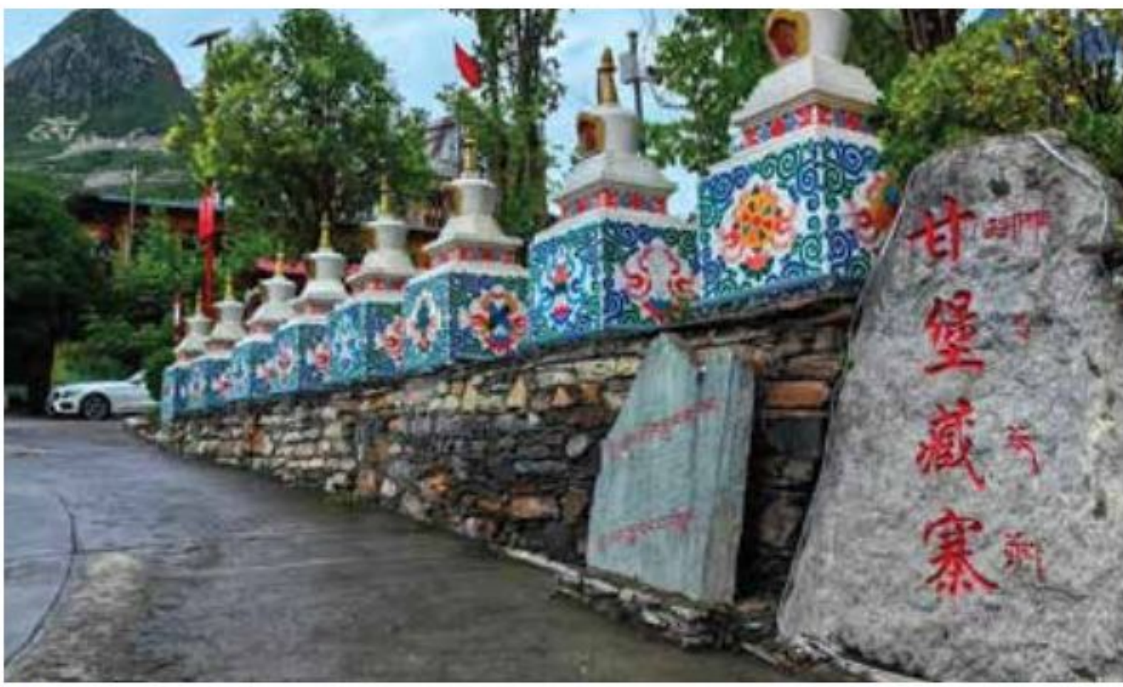
甘堡藏寨 Ganbao Tibetan Village