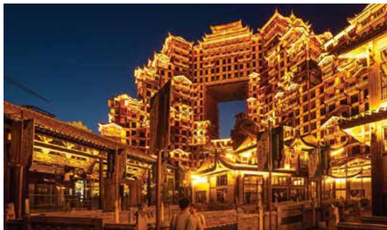
七十二奇楼 72 Tujia Stilted Buildings