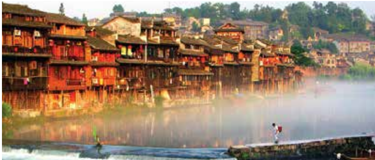
凤凰古城 Fenghuang Ancient Town