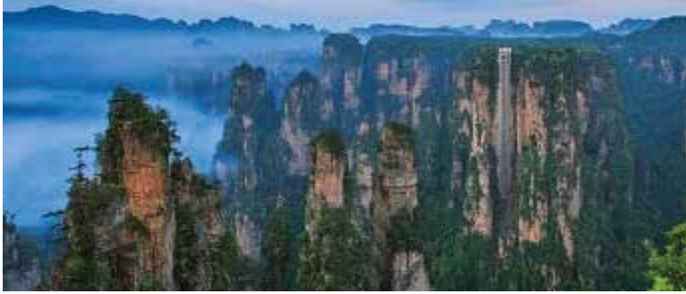
袁家界景区 Yuanjiajie Scenic Area