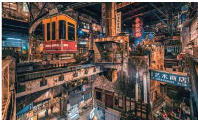
超级文和友 Wenheyou Complex