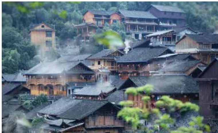
墨戎苗寨 Morong Miao Village