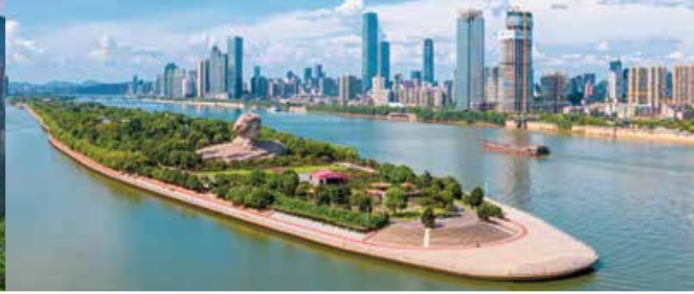
橘子洲公园 Orange Isle Park