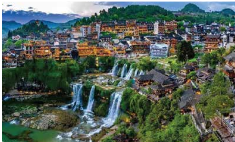
芙蓉镇 Furong Town