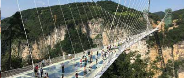
张家界大峡谷 Zhangjiajie Grand Canyon